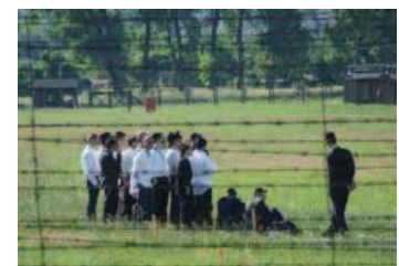
Reflecting on what they have seen in Majdonek