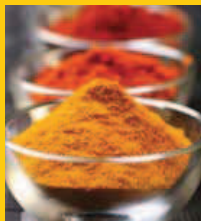
THE SUPER SPICE | 24