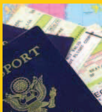
DATELINE HALACHOS | 58